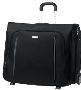
44930 (V46*115): GARMENT BAG/WH. LIGHTER: GARMENT BAG WITH WHEELS 61,5 X 52 X 28 - 4,56 KG 36859 (V46*015) - 4,58 KG*