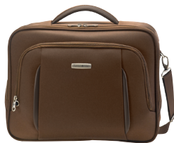
44938 (V46*118): SHOULDER BAG LIGHTER: SHOULDER BAG 41 X 33 X 16 - 23,00 L - 1,02 KG **38,5 X 27 X 04 41,7 CM/16,4" 36862 (V46*018) - 1,26 KG*