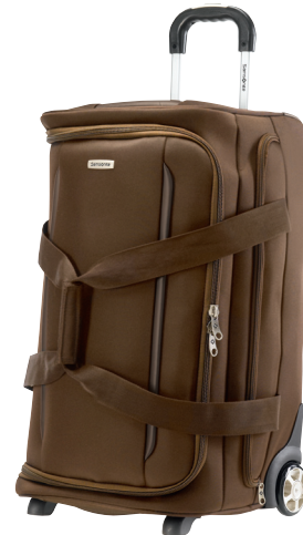
44919 (V46*112): DUFFLE/WH. 64/23 LIGHTER: DUFFLE WITH WHEELS 64 X 38,5 X 32 - 70,00 L - 3,60 KG 36856 (V46*012) - 3,98 KG*