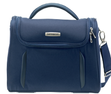
44942 (V46*119): BEAUTY CASE LIGHTER: BEAUTY CASE 32 X 30 X 17,5 - 13,50 L - 0,92 KG 36863 (V46*019) - 0,96 KG*