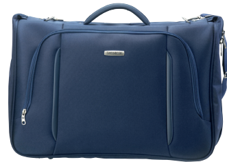
new 44935 (V46*132): BI-FOLD GARMENT BAG LIGHTER: GARMENT BAG 55 X 40 X 20 - 1,78 KG