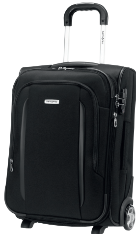
44886 (V46*102): UPRIGHT 55/20 EXP. LIGHTER: UPRIGHT 39 X 55 X 20/24 - 43/45,5 L - 3,24 KG 36846 (V46*002) - 3,62 KG*