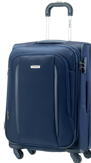
44905 (V46*121): SPINNER 63/23 EXP. LIGHTER: SPINNER 41,5 X 63 X 30/32 - 66,5/70,5 L - 4,38 KG 39048 (V46*021) - 5,10 KG*