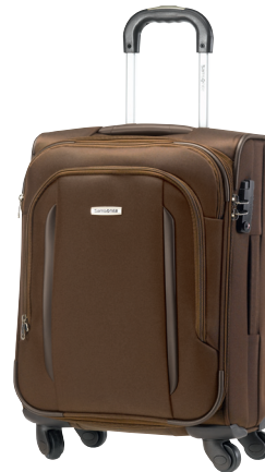
44900 (V46*122): SPINNER 55/20 LIGHTER: SPINNER 38,5 X 55 X 23 - 49,00 L - 3,64 KG 39052 (V46*022) - 4,28 KG*