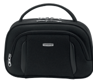
44943 (V46*120): TOILET KIT LIGHTER: TOILET CASE 29 X 19 X 08 - 6,50 L - 0,40 KG 36864 (V46*020) - 0,42 KG*