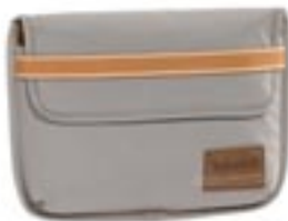
39995 (T80*001) Laptop Sleeve XS cm 23 x 32.5 x 4.5 9" x 13" x 2"