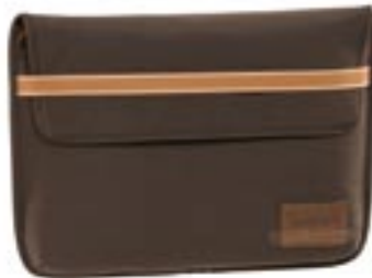
39996 (T80*002) Laptop Sleeve M cm 30 x 43 x 5 12" x 17" x 2"