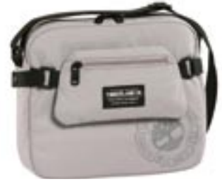
40663 (79*004) Horizontal Shoulder Bag (7L) cm 25 x 32 x 9 10" x 13" x 4"