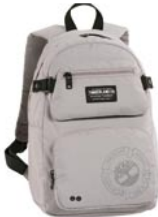
40665 (79*006) Backpack (14L) cm 40 x 25 x 17 16" x 10" x 7"