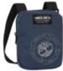
40192 (79*002) Mini Shoulder Bag (1L) cm 19 x 16 x 2 7" x 6" x 1"