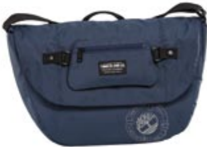
40664 (79*005) Laptop Messenger Bag (13L) cm 28 x 47 x 13 11" x 19" x 5"