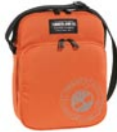
40662 (79*003) Shoulder Bag (4L) cm 27 x 23 x 8 11" x 9" x 3"