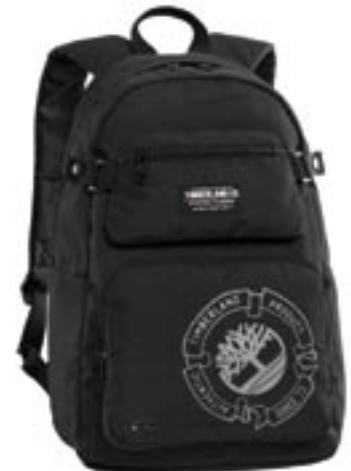
40666 (79*007) Laptop Backpack (20L) cm 44 x 29 x 17 17" x 11" x 7"