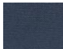
1292 (*01) Denim Blue Preselling